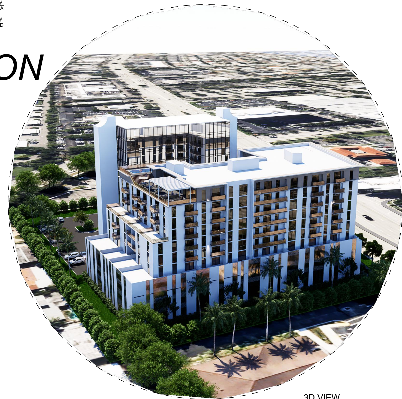
3D VIEW HEIGHT TRANSITION SCALE: 1" = 20'-0"

* The City has determined proposed height transition meets the intent for the code and generally aligns the mass of the building with the existing structure.